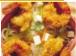
Crispy Shrimp Noodle Bowl