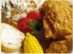
Brewpub Fried Chicken