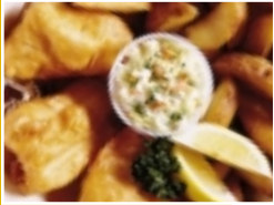
Bayou Battered Cod