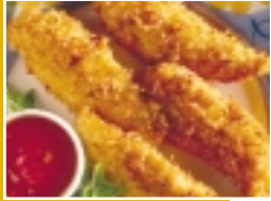
Coconut Chicken Tenders