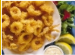
Red Chile Calamari

Like coconut shrimp? Try crispy coconut tenders! Chicken pieces dredged in Golden Dipt Pre-Dip Batter Mix, then coated with a mixture of Golden Dipt Panko Japanese Bread Crumbs and Snowflake® Coconut. Served with a sweet & sour sauce. An excellent appetizer to share!