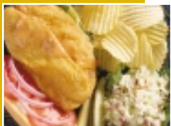
Catfish Po Boy Sandwich

Chicken tenders breaded in Golden Dipt Homestyle Chicken Coating and deep fried until golden brown. Tossed with tomato wedges, red cabbage, leaf lettuce, purple onions and yellow bell peppers, and topped with feta cheese crumbles. Served with your favorite dressing and a smile.