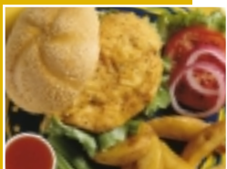
Buffalo Chicken Sandwich

Catfish fillet freshly breaded with Golden Dipt Old South Fish Fry and fried to a golden brown. Then placed on a hoagie roll with lettuce, tomato, onion and tartar sauce spiced up with Wingers Hot Sauce. Served with cole slaw, potato chips and dill pickle spear. A southern favorite!